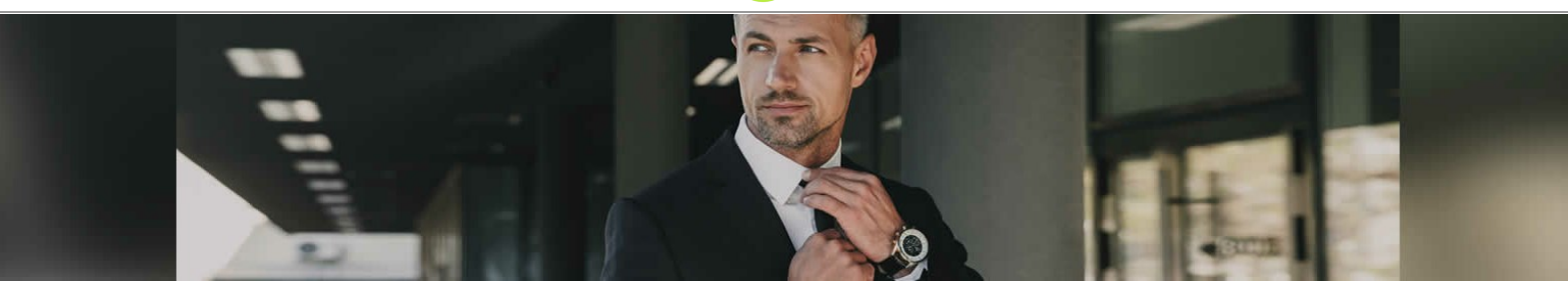
See more at www.zandax.com/courses/making-the-transition